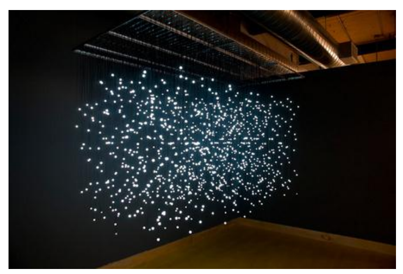
Jim Campbell Exploded View 2010

The Museum, Kitchener Sep 16 2011 to Jan 22 2012 by Richard Rhodes