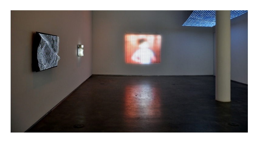
"Jim Campbell: New Work" at Bryce Wolkowitz Gallery installation view. Jim Campbell, courtesy Bryce Wolkowitz Gallery, New York.

Campbell's works display video footage—some shot by him, some bought off eBay—via various delivery systems. These include LEDs, LCDs, projectors, TVs, customized electrical displays, and video screens, often mounted behind diffusing Plexiglas or, in the newest works, machine-carved resin. The subject of the work is often the act of perception itself—our ability, for instance, to discern in Ambiguous Icon #1 Running Falling (2000) the silhouette of a person moving against a background of 165 red LEDs.