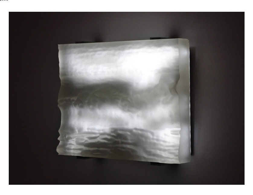
Jim Campbell, Topography Reconstruction Wave (2014).

video of a flame behind a resin rendering of a photograph of Campbell's face. In addition to the process of stripping away visual information in his low-resolution videos, he is increasingly interested in the conversion of one type of media into another—in the case of the resin works, transforming black-and-white images into three-dimensional sculptures. The effect is deeply unsettling because of the way in which the video's flickering lights interact with the translucent resin