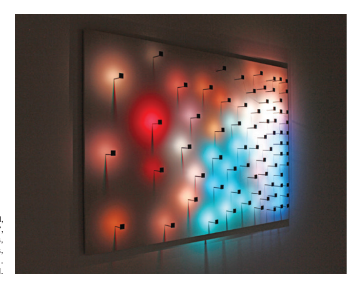
Jim Campbell, Exploded Flat 2, 2017, aluminum, LEDs, custom electronics, 48 × 72 × 4<sup>1</sup>/<sub>2</sub>".

twenty paces away, the central cluster of projections resolved into a coherent cinematic image: a current of walking figures moving toward the camera before literally splintering into glittering fragments of color at either side of the frame. While the footage was never in full focus, the viewer was just able to discern pink pussy hats being worn by many of the figures, revealing the work as incorporating a recording of one of the women's marches that erupted nationwide during the presidential inauguration this past January.